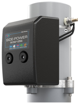
Complete Motor Assembly

The main components of the SE30 Unit are the motor, the solenoid, the solenoid cover, the motor bracket, the gearleg, and the propeller.