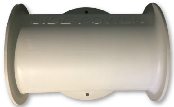
125mm Stern Tunnel