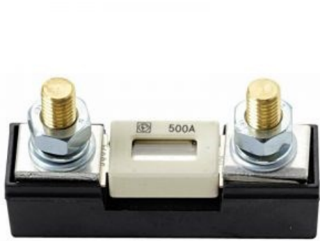
Fuse Holder with Cover