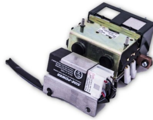
SE30 Solenoid with ECU