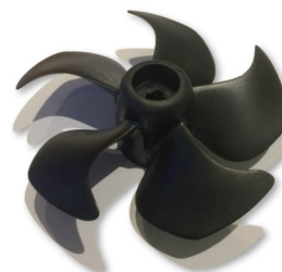
SE30 5-Blade Propeller