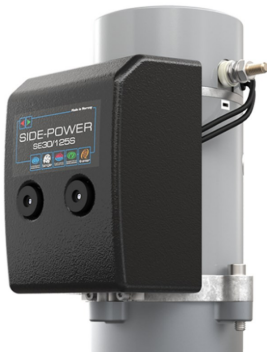
Complete Motor Assembly

The main components of the SE30 Unit are the motor, the solenoid, the solenoid cover, the motor bracket, the gearleg, and the propeller.