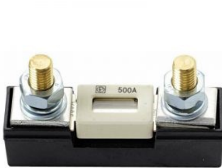
Fuse Holder with Cover