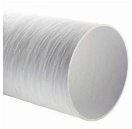
125mm GRP Tunnel