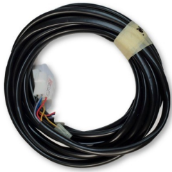
7m Wiring Loom