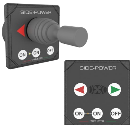
Choice of Controller