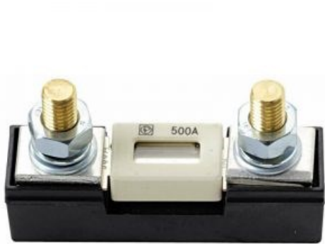
Fuse Holder with Cover