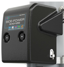
SE40 Solenoid Cover