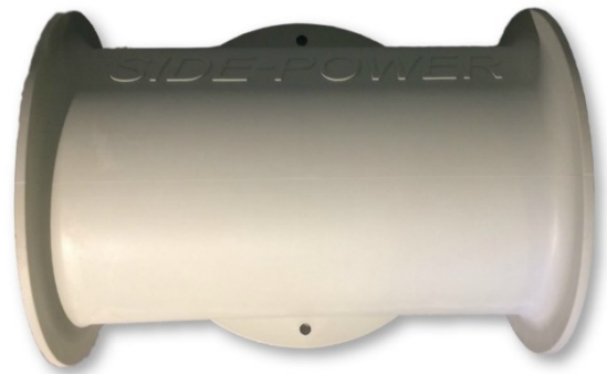
125mm GRP Tunnel