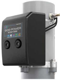
Complete Motor Assembly

The main components of the SE40 Unit are the motor, the solenoid, the solenoid cover, the motor bracket, the gearleg, and the propeller.