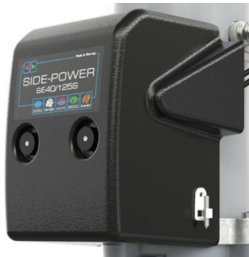
SE40 Solenoid Cover