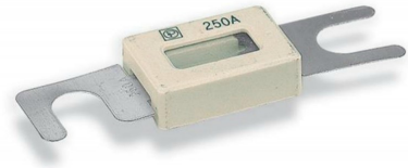
250 Amp ANL Fuse