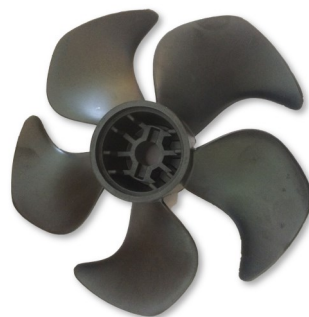
SE60 5-Blade Propeller