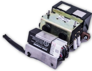
SE60 Solenoid with ECU