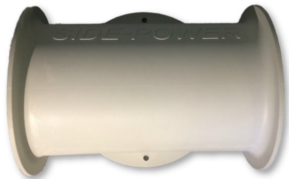
185mm Stern Tunnel