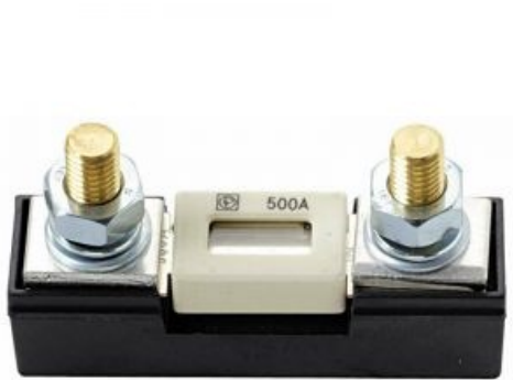
Fuse Holder with Cover