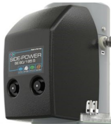
SE60 Solenoid Cover