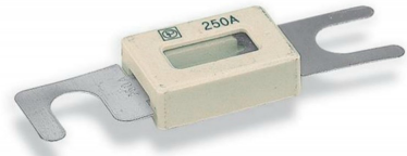
250 Amp ANL Fuse