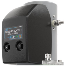
Complete Motor Assembly

The main components of the SE60 Unit are the motor, the solenoid, the solenoid cover, the motor bracket, the gearleg, and the propeller.