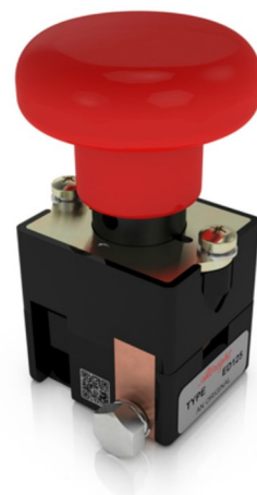
Battery Disconnecting Switch